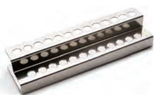
HI740216 Test Tube Cooling Rack

For safety, the optional HI740217 safety shield and HI740216 test tube cooling rack for the HI839800 are strongly recommended.