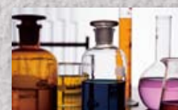
Brine, deicing solution, medicine, chemical, cosmetics, cleaning solution