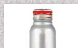
Fruit juice, soft drink, carbonated beverage