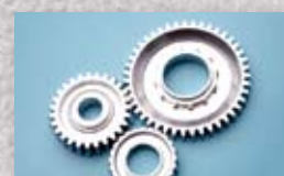
Firefighting foam, soluble cutting oil