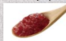
Jam, syrup, confectioneries