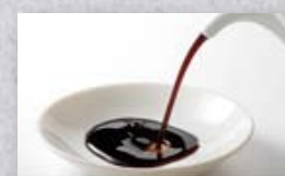
Condiment, seasonings, ketchup, various sauces, soy sauce