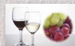
Grapes, wine must