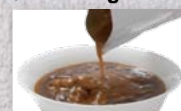
Chinese noodle soup, various soup, various sauces