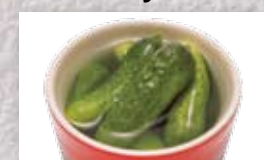
Sodium chloride solution, sea water, pickles