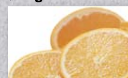
Fruit and vegetable juice, leaf juice, stem juice, root juice