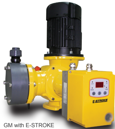
GM with E-STROKE electrical capacity controller