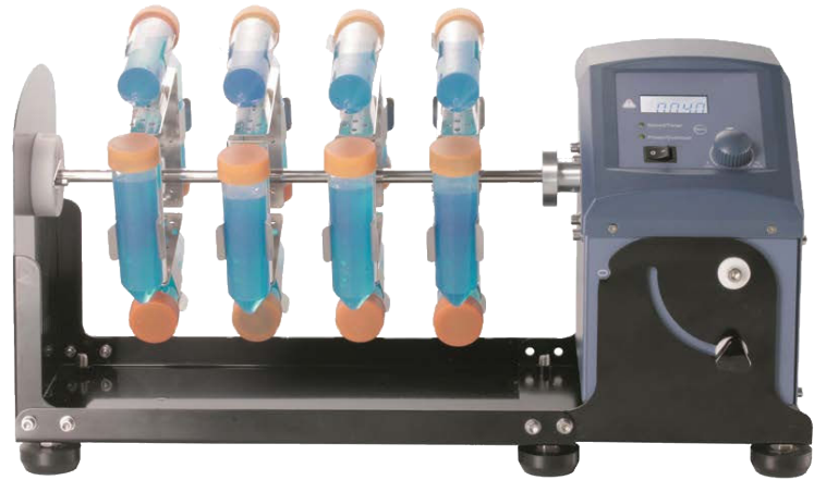
MX-RL-Pro LCD Digital Rotator